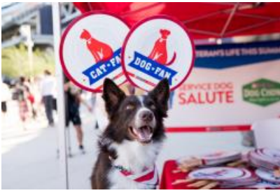
Nestlé Purina Honors Veterans during the 57th Congressional Baseball Game

For more than 90 years, Nestlé Purina has proudly supported veterans by partnering with organizations who assist them during their transition back into civilian life. On Thursday June 14, Purina honored all veterans with a service dog salute featuring three associates who served in the U.S. Military at the 57 th Congressional Baseball Game in Washington, DC.