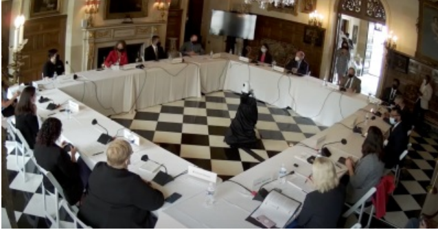
PHOTO RELEASE: Nemours Children's, Delaware Congressional Delegation Host HHS Secretary Becerra for a Children's Mental Health Forum

To view and download photos from the forum on children's mental and behavioral health, please click here .