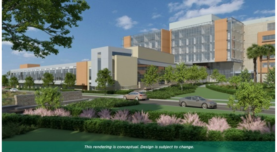
Emergency Department Expansion