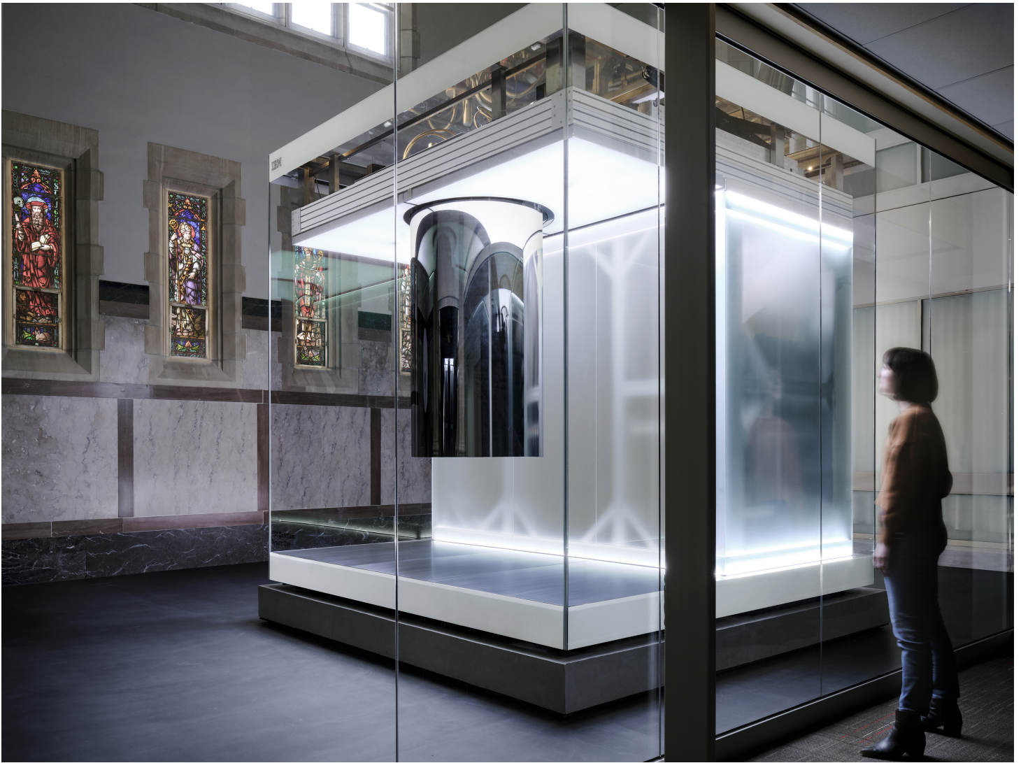
Pictured: a photo of the utility-scale IBM Quantum System One, which was unveiled on April 5, 2024 in RPI's Voorhees Computing Center, a former cathedral. It is the first IBM Quantum System One to be installed on a university campus.