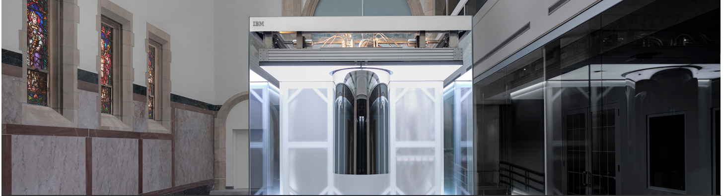
Pictured: a photo of the utility-scale IBM Quantum System One, which was unveiled on April 5, 2024 in RPI's Voorhees Computing Center, a former cathedral. It is the first IBM Quantum System One to be installed on a university campus.

Now online, the IBM quantum system will expand the longstanding RPI and IBM partnership to accelerate quantum computing research, workforce development, and education in New York