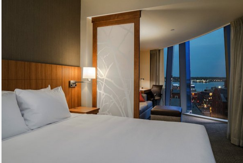
Hyatt Place Portland – Old Port offers 130-roomy rooms

PORTLAND, Maine (May 20, 2014) – Hyatt Hotels Corporation (NYSE: H) and Commonwealth Hotels, LLC today announce the opening of Hyatt Place Portland – Old Port, situated in the heart of the Old Port amongst unique boutiques, tourist attractions and nationally recognized restaurants. Hyatt Place Portland-Old Port features rooms with breath taking views of Casco Bay, the Portland skyline, Historical Old Port, and is only minutes from the Portland International Jetport (PWM). As the first Hyatt Place hotel in the state of Maine, the hotel is a refreshing new choice for business and leisure travelers alike.