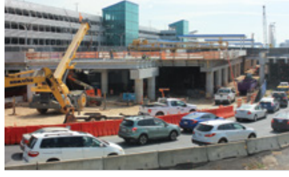
Elevated Roadway and Terminal Curb Front

Renovations on Concourse C are progressing with