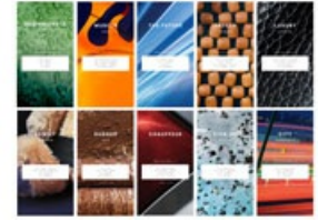
CLICK IMAGE FOR HIGH RES VERSION

DETROIT, Jan. 6, 2017 -- What does the driverless car of the future smell like? An aromatic mixture of hard drive, laptop, GPS and sandwich, according to Ally, which will introduce two new scents to its "New Car Smell" exhibit at the 2017 North American International Auto Show (NAIAS) in Detroit. The new scents called "The Future" and "Chauffeur" take a humorous approach to the auto industry trends of driverless cars and ride sharing, encouraging show visitors to imagine how the cars of the future might smell. The exhibit will be open from January 9 - 22 at Ally's booth, located in the main concourse between Hall B and Hall C at Detroit's Cobo Center.